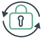
Identification and Verification

IPI offers comprehensive security solutions that deliver complete protection from the start to the end of every call. From call recording and archiving, PCI phone payments, to fraud detection and speech analytics, our solutions provide industry leading functionality and security.